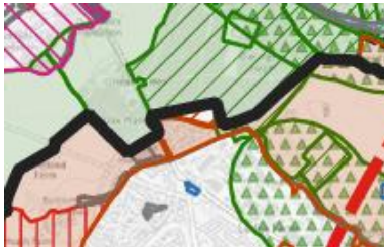
Extract from Reg 18 Consultation

Both in plan form and on site, it is clear that the northern by-pass (Poppy Fields Way) provides a strong edge to the built-up area to the south and a buffer with the countryside to the north. In particular, it provides this buffer between the dwellings and the woodland at Harlestone Firs Forest. This is shown below: